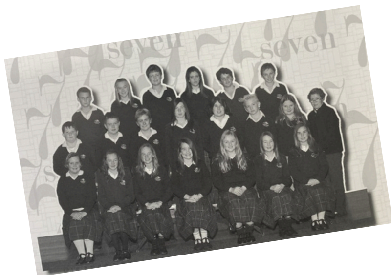
Students from 7G - pictured above in 2009 - will celebrate their 30-year reunion later this year.