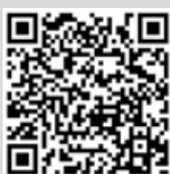
Warrnambool College Schools' Privacy Policy